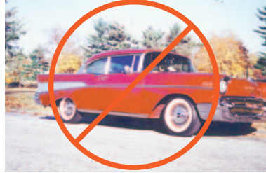
Do not cut off any part of your Classic!