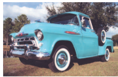
Make sure the background is simple and your Classic is centered appropriately!