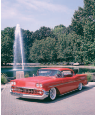
Vertical photos as well as horizontal photos should be taken of your Classic!

Often times, we hear from our members that they would like to send in a feature for Member's Pride, but don't know how to photograph their car for a magazine. We have put together some simple tips to help you better understand what types of snapshots enhance the look of your Chevy Classic.