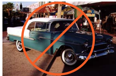
Make sure there are no shadows on, or clutter around your Classic!