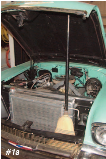
Photo #1a & 1b & 1c: People will use anything to prop up their hood - from a broom handle to a pair of Vise-Grips to hose clamps around the arms of the hinge. Whatever it takes.