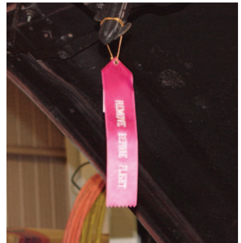
Photo #4: With the brace installed, there is no way that hood is coming down. Just remember to remove it at the end of the show or you will not be able to close your hood. As a reminder you can hang the supplied "Remove Before Flight" ribbon on your hood latch. This will also keep those judges from trying to close your hood without removing the brace. Good luck. ▼

Photo ##3a & 3b: The square end of the limiter hooks around the forward arm on the hinge while the round end hooks around the rear arm. With the brace installed, pull the hood down about 1" to lock it into place.