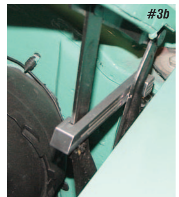
Photo ##3a & 3b: The square end of the limiter hooks around the forward arm on the hinge while the round end hooks around the rear arm. With the brace installed, pull the hood down about 1" to lock it into place.

Photo #4: With the brace installed, there is no way that hood is coming down. Just remember to remove it at the end of the show or you will not be able to close your hood. As a reminder you can hang the supplied "Remove Before Flight" ribbon on your hood latch. This will also keep those judges from trying to close your hood without removing the brace. Good luck. ▼