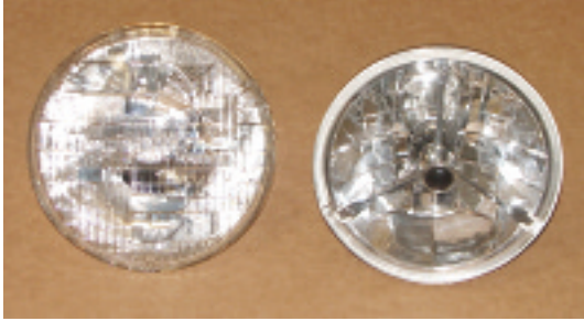
Photo #5: The Tri-Bar H-4 halogen headlights are available with a clear, black, red or blue center dot. We are installing the P/N 28-67 headlights with the black dot. These will really give the front of our 1955 a super custom look versus the replacement sealed beam light bulbs. You can choose the color dot that you think will best complement your paint scheme.

Photo #4a & 4b: To remove the headlight bulb, ring and sub bucket assembly, simply pull forward on the retaining spring that is hooked into the stainless ring and disengage the ring from the adjuster screws. If your retaining spring is hooked directly to the sub bucket, remove the three screws and the headlight bulb can be removed from the sub bucket.