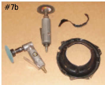
Photo #7a & 7b & 7c: The hole in the rear of the sub bucket measures 2-1/2". In order for the new Tri-Bar bulb to fit, it will need to be enlarged to 3-1/2". Using a cut-off wheel or jig saw, trim the rear lip of the sub bucket.