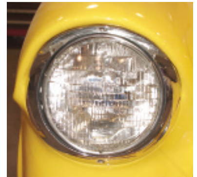
Photo #2: To change the headlight, first the headlight bezel must be removed. The 1955 headlight bezel is held to the headlight bucket with two #6 counter sunk sheet metal screws located at 6:00 and 12:00 o'clock.