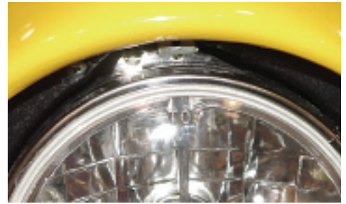
Photo #8: Install the sub bucket back into the headlight assembly and install the headlight and trim ring. The Tri-Bar halogen bulb will plug into the stock wiring harness. The headlight is marked "TOP", so when the headlight is installed the "TOP" mark should be at 12:00 o'clock. If you did not disturb the headlight adjuster screws, you should not need to adjust the headlights. If your lights were out of adjustment, be sure to adjust them (at night using your garage door as a target works well) as needed.

Now the Tri-Bar headlight will fit the sub bucket perfectly.