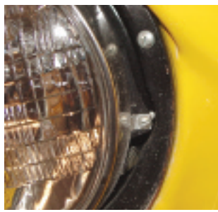
Photo #3: There is a stainless steel trim ring that surrounds the headlight bulb that holds the bulb in place. On a 1955 there are three screws that hold the trim ring to the headlight sub bucket. This assembly is then secured to the bucket with the adjusters and spring. On the 1956 and 1957 cars, the headlight trim ring snaps over the sub bucket and is held in place with one spring attached to the headlight bucket.