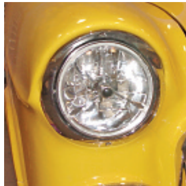
Photo #9: Last, install the headlight bezel. There is no comparison between the new Tri-Bar headlights and the replacement sealed beam headlights. The Tri-Bar headlights really give the front end of the car a custom look and will help you see better when driving at night! Good Luck. ✓