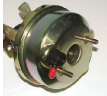
Photo #1: The aftermarket power brake boosters that are used in the Eckler's Classic & Late Great Chevy power brake/dual master conversions for the 1955 to 1964 cars accept the common dual master cylinder from 1968 to 72 A and F-body cars. The aftermarket boosters have a

To order parts call 1-800-456-1957 or visit ClassicChevy.com