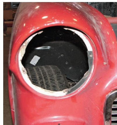
Photo #12: A flat rubber seal fits between the headlight bucket and the front fender. When you removed the bucket from the fender, the seal was probably not there or was dried up and broken. We will replace these seals.