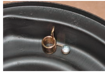
Photo #9: The new spring is held to the bucket with a #8 sheet metal screw, also supplied.