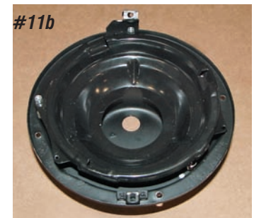
Photo #11a & 11b: The original sub bucket has two ears that will key into the grooves on the adjuster screws. If your sub buckets and rings need to be replaced, order P/N 28-09.