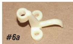
Photo #6a & 6b: The replacement adjuster brackets included in kit P/N 34-100 are made of nylon and attach to the headlight bucket using the supplied hardware. There is a tail on the replacement bracket that must be removed for this application. Using a pair of side cutters, remove half of the tail.