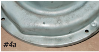
Photo #4a & 4b: Using the grinder, grind off the head of the rivet for the sub bucket spring and drive the rivet out.