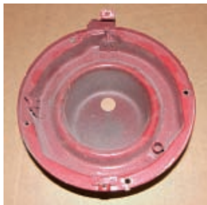
Photo #1: The bucket has two adjuster screws and a coil spring that attaches to the sub bucket both to hold it in place and for adjustment. Many times the nylon blocks on the adjusters strip out or break off and the hook on the spring will break.