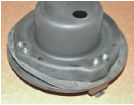
Photo #14: The headlight bucket seals P/N 05-15 for 1955-56 and P/N 05-53 for 1957 will match the contour of the bucket and fit between the bucket and fender.