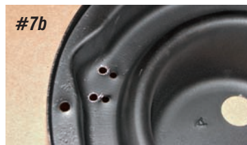
Photo #7a & 7b: New holes must be drilled for the new adjuster brackets. Using the original holes as a guide, line up the new bracket to the outside of the original holes and mark the bucket where the new holes need to be drilled. Drill two 3/16" holes for the new mounting hardware.