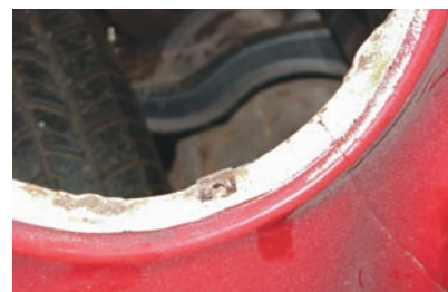
Photo #13: There are four J-nuts at the front opening of the fender for the headlight bucket retaining screws. These new nuts are supplied with the hardware kit.