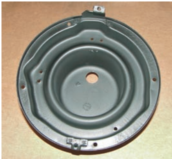
Photo #5: With everything removed, clean the bucket and paint it chassis/semi gloss black P/N 49-344.