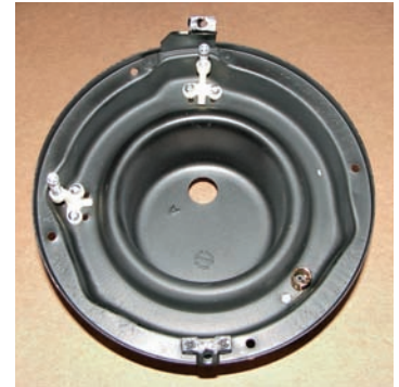
Photo #10: The refurbished bucket is now ready to go back in the car. It's always fun to take a damaged original part and with a little time and money bring it back to something that will last another 50 years!