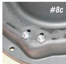
Photo #8a, 8b & 8c: The new adjuster brackets are attached to the bucket with two #10-32 X 3/4" machine screws, serrated washers and nuts supplied with the kit.