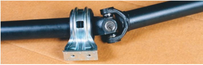
Photo #5: After installing the u-joint, you will now be able to connect the front and rear sections of the driveshaft.