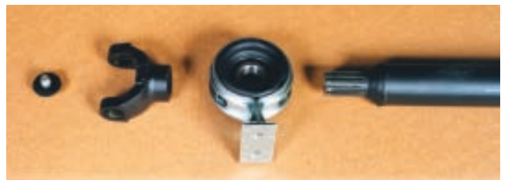
Photo #2: Our original style system has been cleaned and painted. Its now time to install in the frame. Photo #2 shows the front driveshaft section, center carrier bearing, front yoke and yoke attachment bolt and washer.

Photo #3: Press the center carrier bearing onto the splined shaft end of the front shaft. Make sure that this bearing is pressed on all the way. Never use a hammer and punch to seat this bearing.