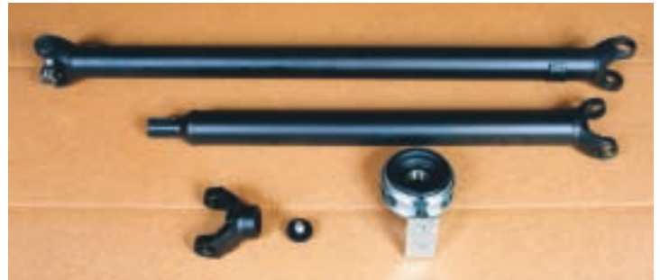
Photo #1: Shows the complete original style drive shaft system. The short shaft with the splines is the front half of the driveline.