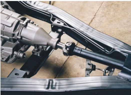
Photo #6: Slide the driveshaft through the X-frame and slip the front yoke into the transmission. Your center support

bearing should now be in installation position. Fasten it in place with the two original bolts.