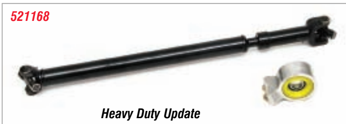
Heavy Duty Update